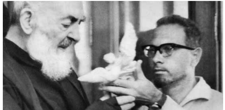
Padre Pio blesses a statue of St. Michael the Archangel for a pilgrim.

Pope John Paul II emphasized the important role of angels when he gave six General Audiences in Rome from July 9 to August 20, 1986 entitled "Angels Participate in the History of Salvation." In his catechesis on the holy angels, Pope John Paul II expressed the hope that all people would come to the realization of the reality of angels. In January of 2009, Pope Benedict XVI stated, "In the face of the challenges of our times and the tribulations which every individual experiences in his life, it is